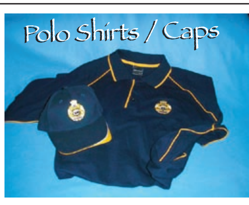
Polo Shirts / Caps

To purchase this merchandise, please contact Dee Rohan at admin@warangers.asn.au